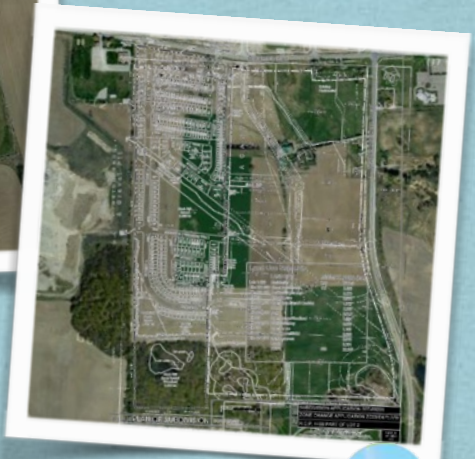
Our neighbour to the east will be Cook Homes. This development has already been subdivided into lots. To the east of Cook Homes is a development by RBJ Schlegel that is somewhat larger.