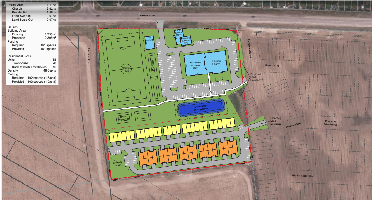
FIG 2 | DEVELOPMENT CONCEPT 1643 Bleams Rd, Kitchener Freedom in Christ Church